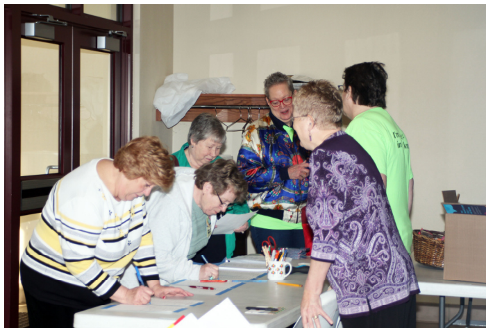
The registration table stayed busy as members signed in and then gathered in the meeting room that quickly filled up!